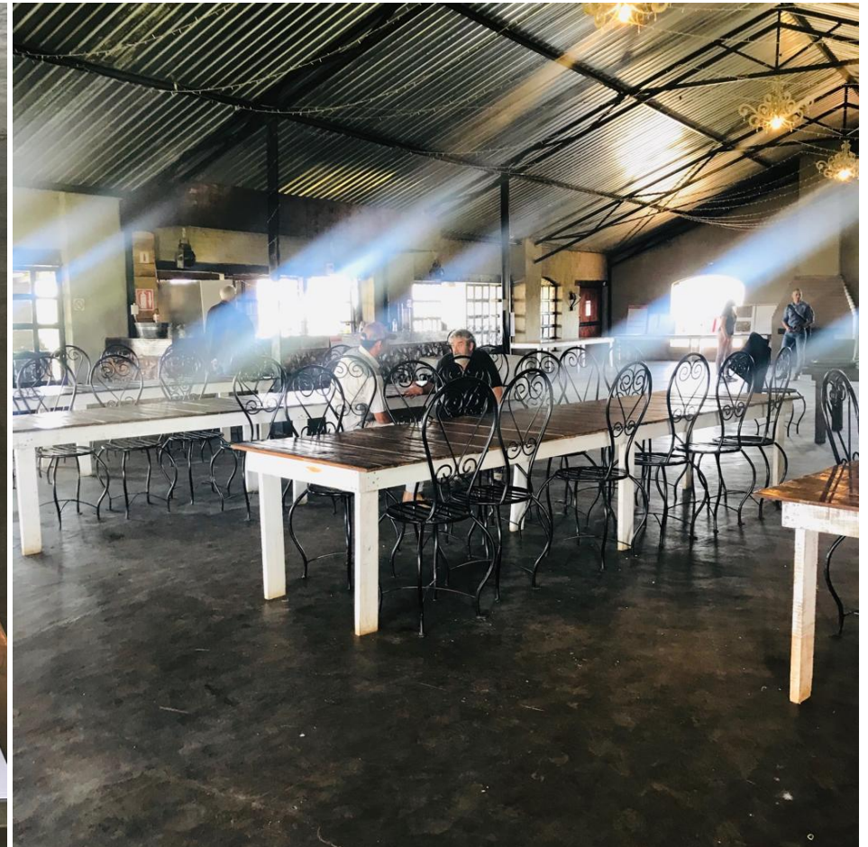
Figure 4: Interested and Affected Parties having a discussion.