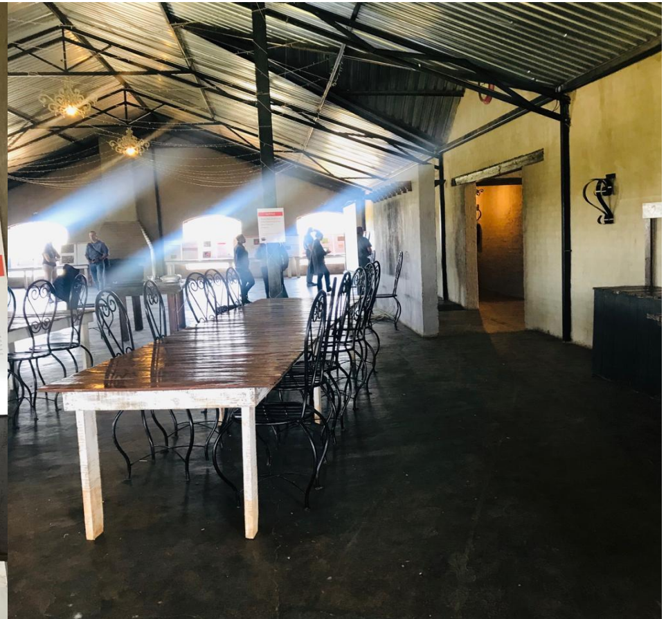
Figure 2: Interested and Affected Parties perusing the Scoping Open Day posters on display.