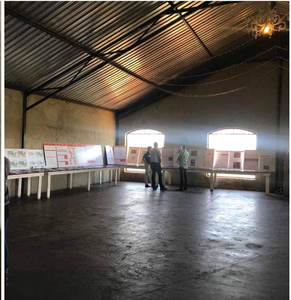
Figure 6: Interested and Affected Parties having a discussion while perusing the Scoping Open Day posters.