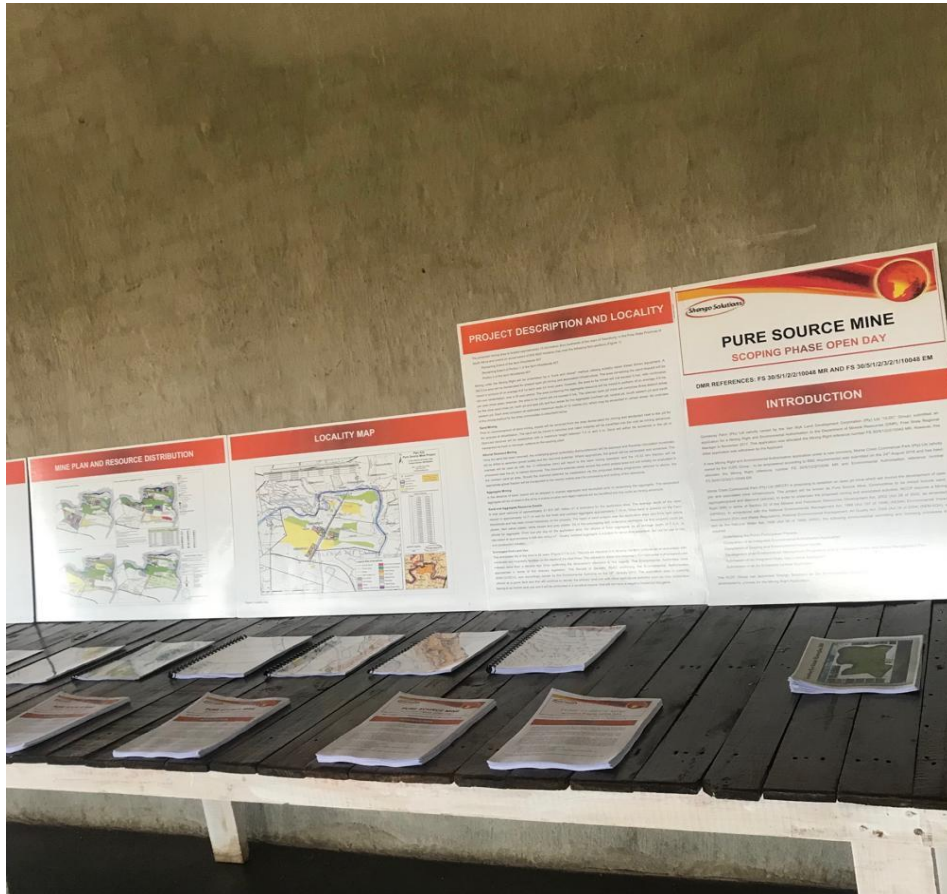
Figure1: A3 Scoping Open Day posters displayed on the wall as well as A4 versions of the posters and the attendance registers placed on the table.