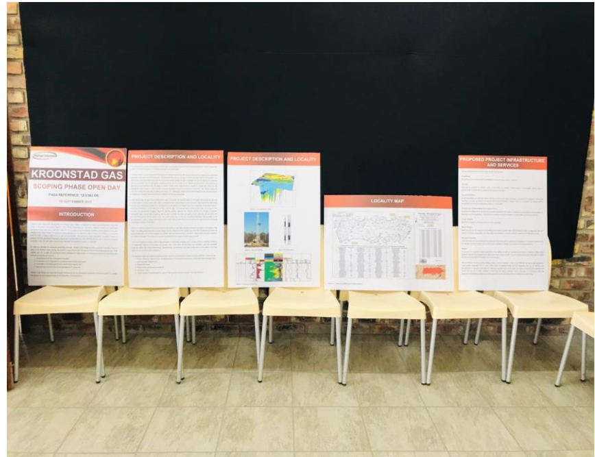
Figure 2: A1 Scoping Phase Open Day posters displayed along the wall.