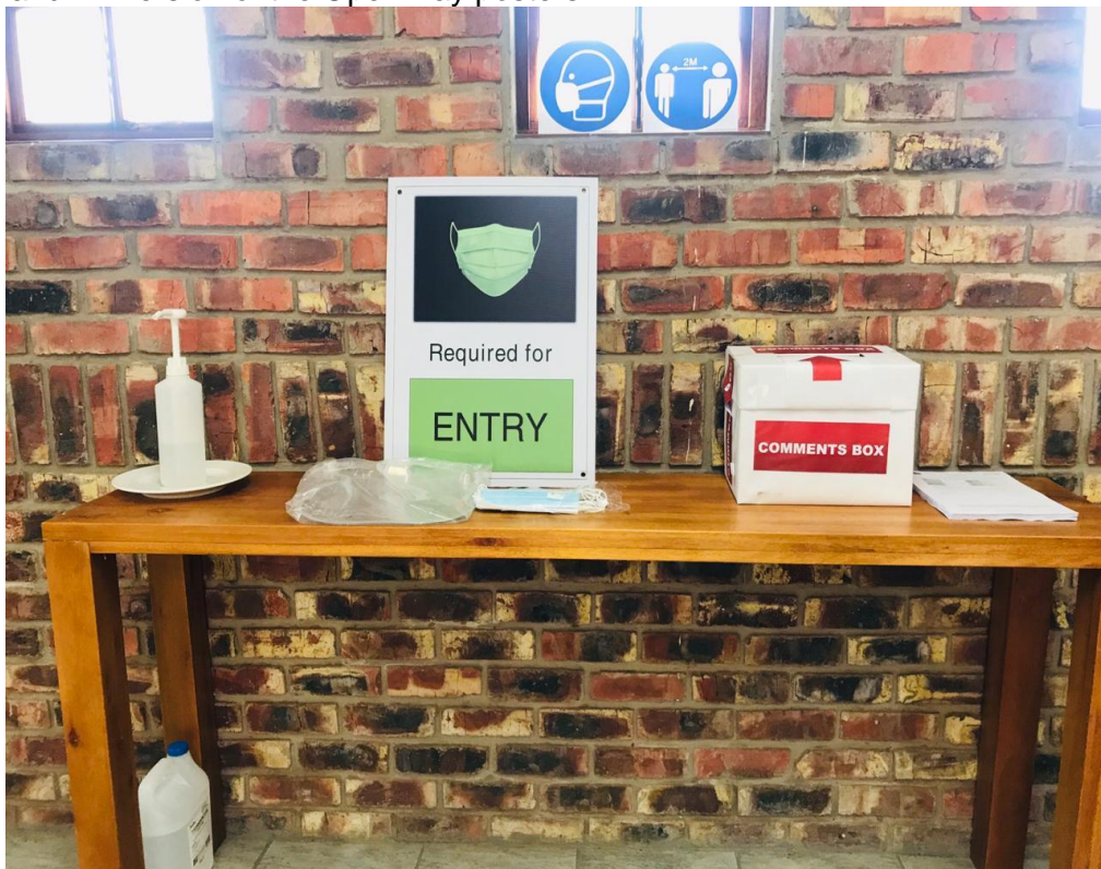
Figure 4: Covid-19 precaution signs, sanitizer and comments box used for placement of comment sheets.