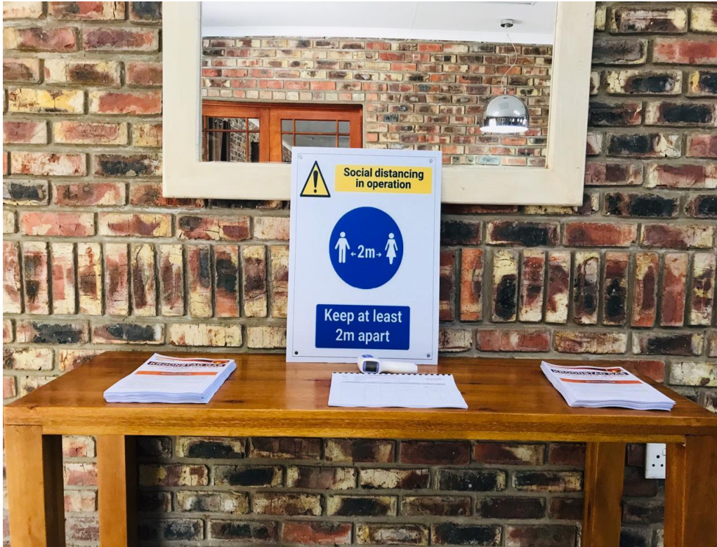
Figure 3: Covid-19 precaution signs placed at the entrance of the venue, attendance register and A4 version of the Open Day posters.