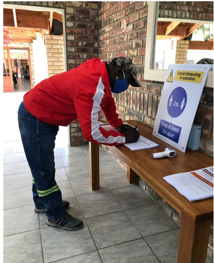
Figure 6: One of the I&APs signing the attendance register upon arrival.