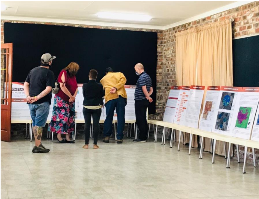
Figure 1: Question and answer session with I&APs.